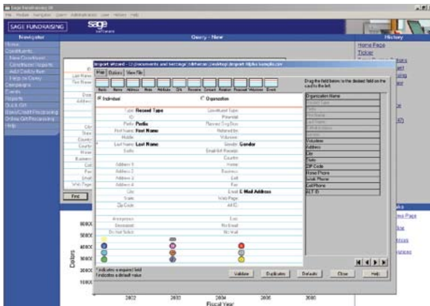
◀ The built-in drag-and-drop data import wizard allows you to get the data you need into Sage Fundraising 50 effortlessly.

Quickly and easily import data from third-party applications, list acquisitions, or other systems in your office. The Data Import Wizard in Sage Fundraising 50 allows you to drag-and-drop data onto the desired card, visually verify its accuracy, and validate your data before importing. Update-and-replace functionality enables you to update a constituent's address in the system or replace items such as e-mail addresses or phone numbers that you have on record. You also can save templates for future imports of the data you consistently need in Sage Fundraising 50.